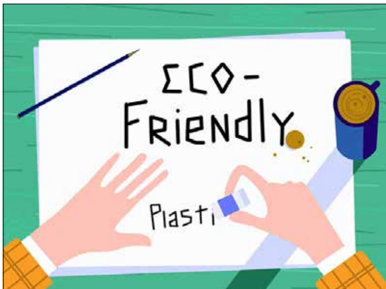
Patrick Yang was one of three third place winners.

Support Visual Arts Academy by visiting their website vaaedu.com/ to purchase a reusable bag decorated with one of these inspiring works of art or to make a donation.