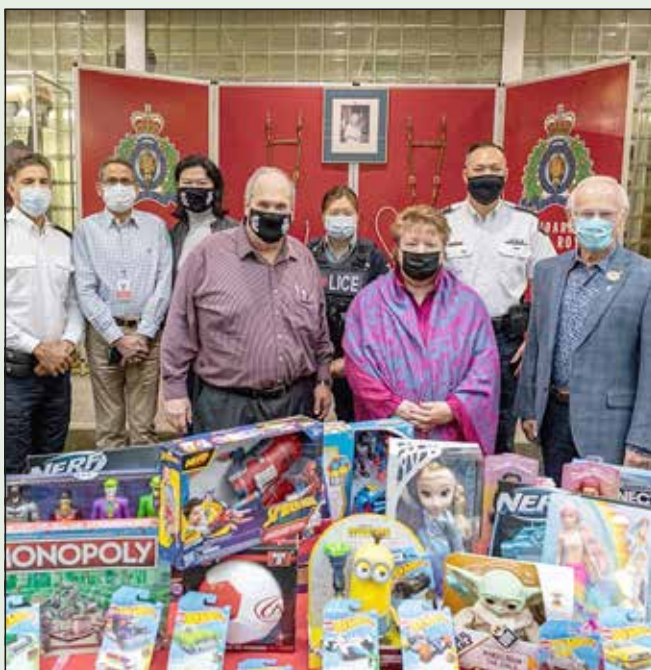
Every year, the Richmond Christmas Fund helps thousands of locals in need.